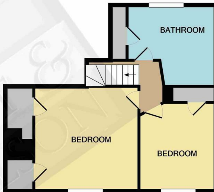
1ST FLOOR APPROX. FLOOR AREA 372 SQ.FT. (34.5 SQ.M.)

TOTAL APPROX. FLOOR AREA 911 SQ.FT. (84.6 SQ.M.)